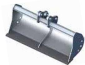
DC1 ditch cleaning bucket

Ditch cleaning buckets are fitted on excavators with a curb weight of up to 46 tons. They are produced in the HD (Heavy Duty) version.