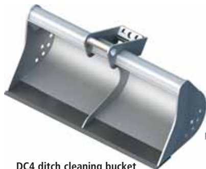
DC4 ditch cleaning bucket with anchoring for Lehnhoff quick coupler